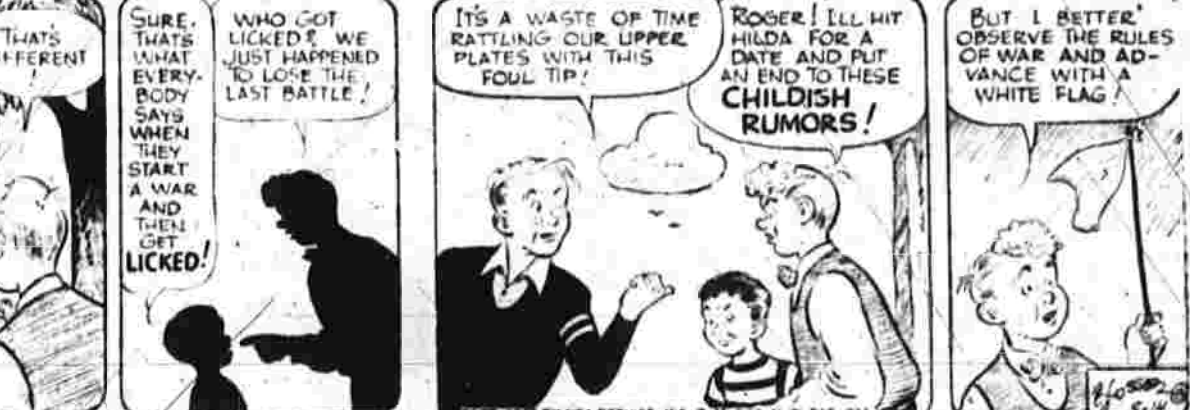
"Freckles and his friend"