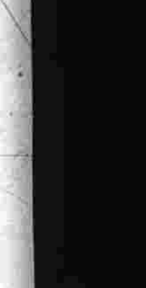
"Things are popping"