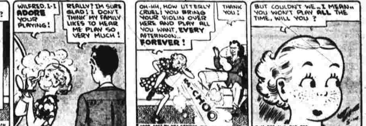
"No, let's talk"