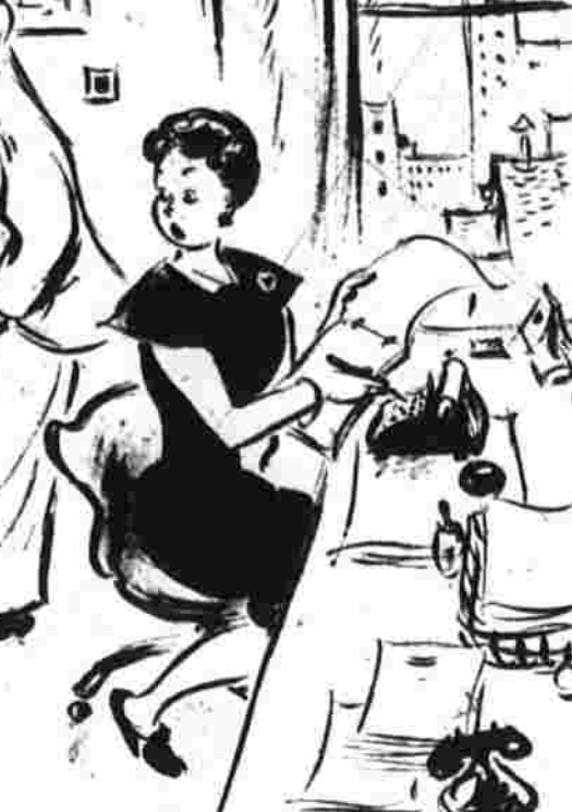
"I thought my bald head was conspicuous, but I've had this toupee three days and nobody has even mentioned it!"