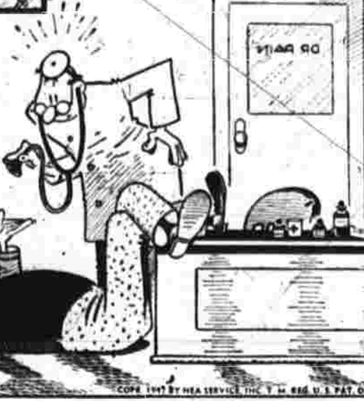
"I think I need a vacation, doc - this is how I feel at the office!"