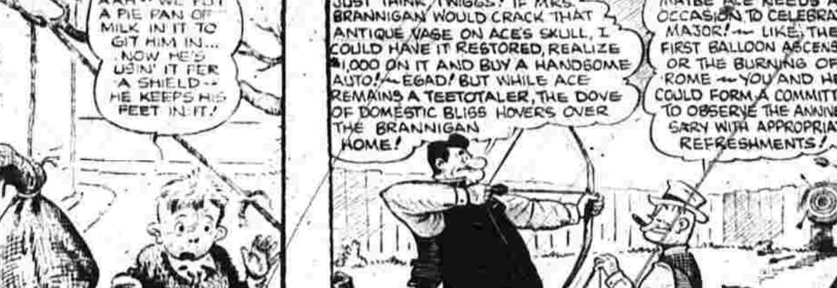
"Our boarding house"