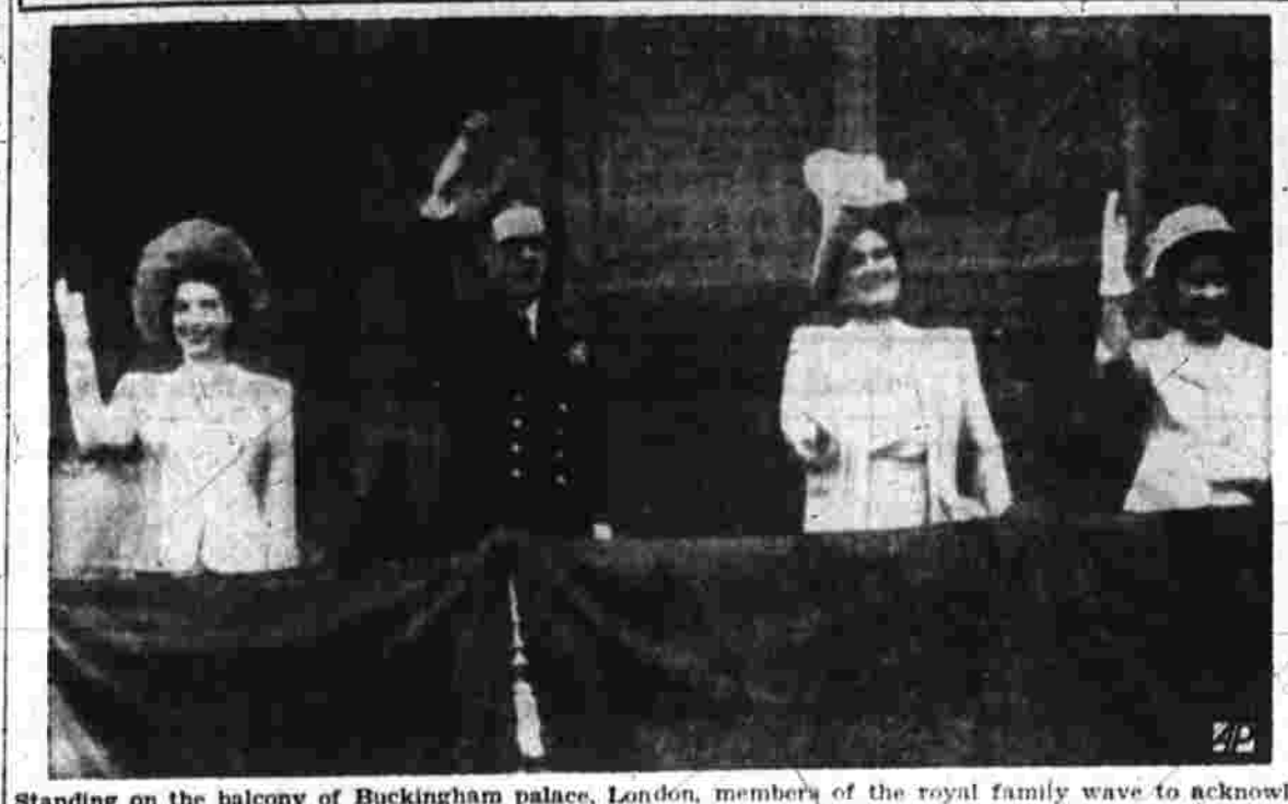
Standing on the balcony of Buckingham palace, London, members of the royal family went to acknowledge the cheers of the crowd welcoming them home from their 23,000-mile South African tour. Left to right: Princess Elizabeth, King George, Queen Elizabeth and Princess Margaret.