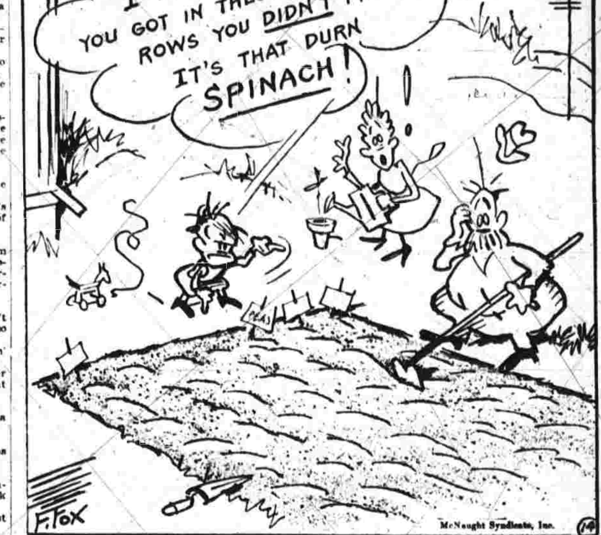
"I know wot you got in these three rows you didn't mark! It's that darn spinach!"